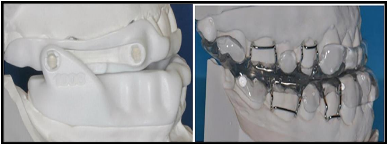
Figure 1: Mandibular Advancement Oral Appliance- Bibloc

Among the different sorts of OA gadgets, the mandibular advancing OAs is the most broadly utilized and acknowledged helpful methodology for patients with OSA. Mandibular advancing OAs extend the upper airway route by repositioning the mandible anteriorly, along these lines prevent obstruction during sleep. Mandibular advancing OAs ( Figure 1, 2 ) can be either fixed (i.e., the level of mandibular progression can't be changed) or semi-fixed (i.e., the level of mandibular progression can be changed). Fixed OAs have a moderately high risk of TMJ issue and dental/occlusal changes, in spite of the fact that they give a dependable restorative impact. Then again, semi-fixed OAs are accounted for as both compelling and agreeable appliance that grant slight mouth opening and lateral jaw development.