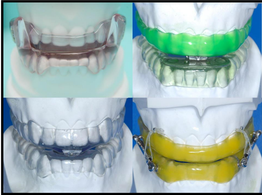
Figure 2: Mandibular Advancement Oral Appliance- Monobloc

daytime sleepiness symptoms, or until uncomfortable for the patient. Improvement in OSA was then frequently confirmed by a subsequent short-term rest concentrate with the appliance.