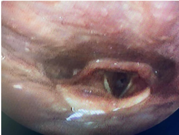
(Image 1: Pre-operative rigid telescopy of larynx showing the narrowing of the tracheal airway)

A rigid telescopy of the larynx was performed which revealed bilateral, normal and mobile vocal cords and adequate glottic airway. The metallic stent was visualised below the level of the vocal cords with a mass lesion over it narrowing the airway of the tracheal lumen.