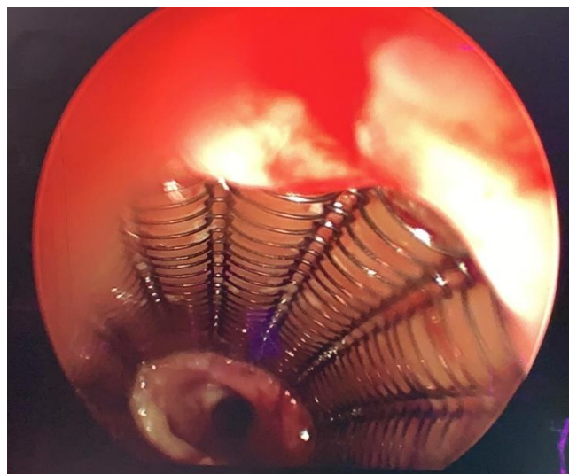
(Image 3: Intra-operative image showing tracheal stent with granulation tissue at upper and lower end)