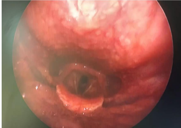
(Image 5: Post operative rigid telescoping of larynx showing an improved tracheal airway)

She was monitored post operatively in cardio-thoracic ICU for a day and then shifted to the ENT ward. Her vitals were stable, there was no stridor and she had no complaints of breathing difficulty. She was discharged and advised to continue steroid inhaler for 1 week.