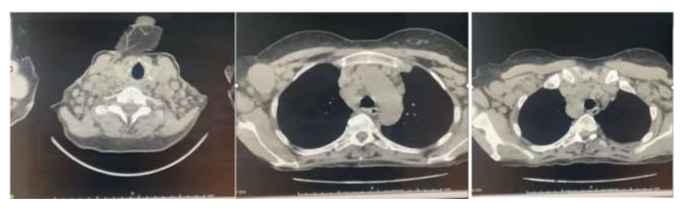
Figure 2: Diffuse adenopathy in conglomerate: Supraclavicular, Mediastinal, Abdominal, Inguinal, Femoral from 20 to 40 mm.

Lymphatic system ultrasound: Multiple lymph nodes in the right parotid gland with a diameter of 30-17mm. Diffuse adenopathy is present in the right latero-cervical and supraclavicular region (dm 30-15mm), also in the left laterocervical region involving the parotid gland and the posterior triangle of the neck. Tumoral markers: CEA, AFP, CA 19-9 (normal), CA 15-3 (↑) 86 (<30 units/mL) CA 125 (↑) 55 (0-35 units/mL), LDH (†) 820 U/L (105-330 U/L). Infective panel: HIV (negative), Mantoux (negative), Toxoplasmosis IgM and IgG (negative), CMV IgG and IgM (normal), EBV IgM (normal) IgG (↑), HbsAg and AntiHCV (negative). CT: Thoracoabdominal Diffuse adenopathy conglomerate form: Supraclavicular, Subclavicular, Mediastinal, Abdominal, Inguinal, Femoral (from 20 to 40 mm) (Figure 2). Finally, lymph node biopsy is performed, where the morphological and immunohistochemical features are consistent with a diagnosis non Hodgkin lymphoma.