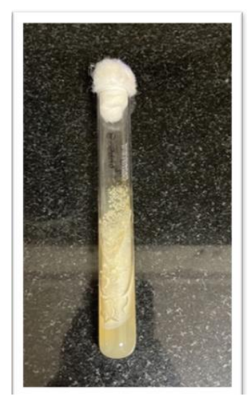
Figure 1- Isolation of candida in culture broth

discharged and thereafter is on regular follow up on outpatient basis.