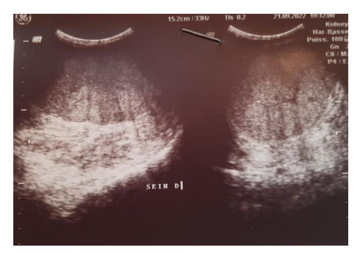
Figure 2: Ultrasound findings in favor of a phyllodes tumor.